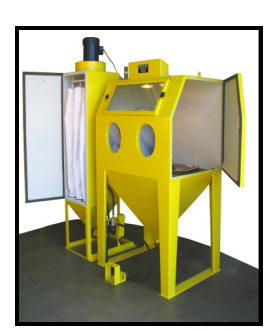
A Good Dust Collector is the best friend of your cabinet