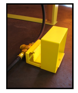
High air flow foot control valve & safety guard Pedal