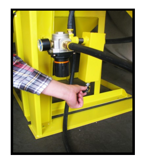
High flow air regulator with pressure booster and moisture separator