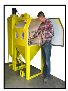
Big loading capacity for greater work production